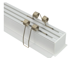
Spring clips for remodel applications